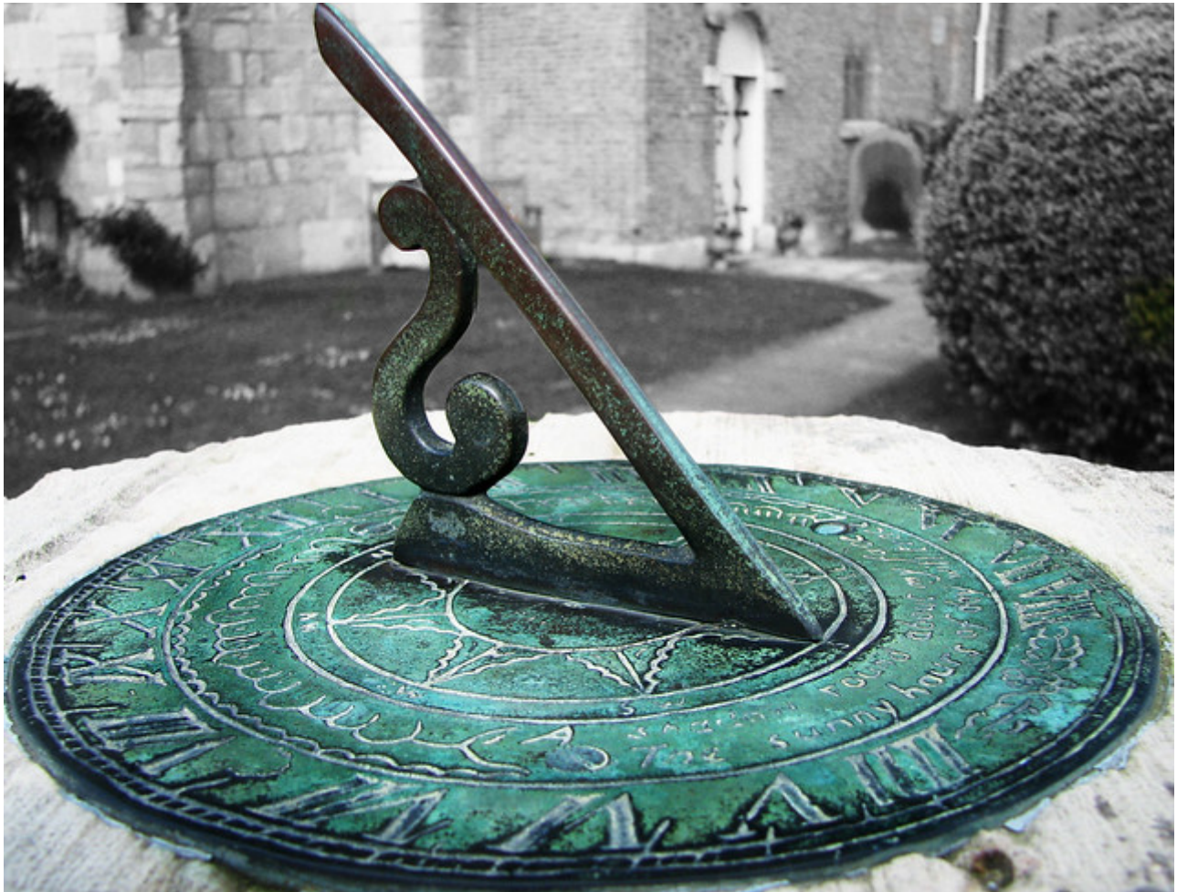
Create a Sundial, Peter Wheelerton

Since time immemorial, sundials have been used to give an indication of time, allowing people to function to a timetable. The ancient Babylonians, Egyptians, Greeks and Mayans were just some of the great civilizations who understood that the position of the sun in the sky, and the shadows it casts, could be used to make an estimate of the time of day.