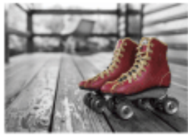
Quiz: Psychology 101 Part 2