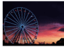
Quiz: Flags in Europe