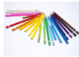
Quiz: Psychology 101 Part 2