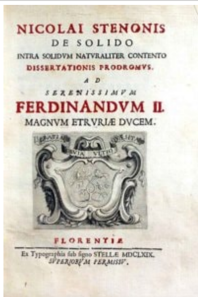
Steno's Dissertation (Public Domain)