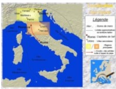
Map of the Italian Renaissance (Public Domain)