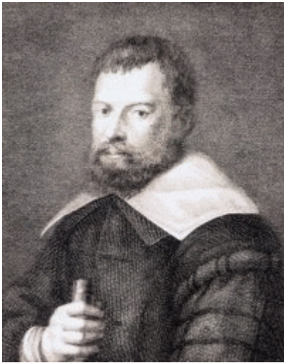
Galileo as a young (Public Domain)