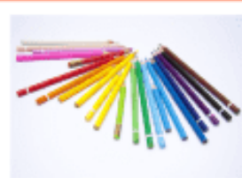
Quiz: Psychology 101 Part 2