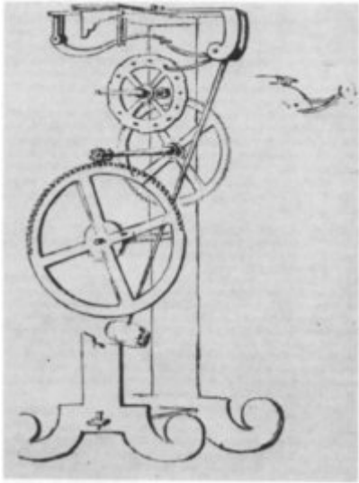
Drawing of pendulum clock designed by Galileo Galilei around 1641 (Public Domain)