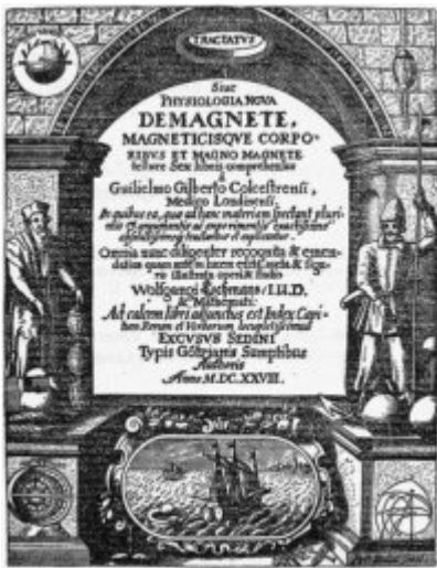
Title Page of De Magnete, by William Gilbert

Magnets, known as lodestones, and their properties of attraction, were well known to the Greeks and the Muslims, and sailors knew that a compass needle pointed towards the north. However, the exact reasons for this were unclear, with many scholars proposing that they were attracted to the North Star or to a group of magnetic mountains lying somewhere within the Arctic Circle. Gilbert was not happy with these explanations and set out to test the properties of magnets, seeking the advice of ship's masters and compass manufacturers. He discovered a number of properties of magnets, using a large, spherical lodestone and a freely moving compass needle.