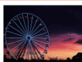
Quiz: Flags in Europe