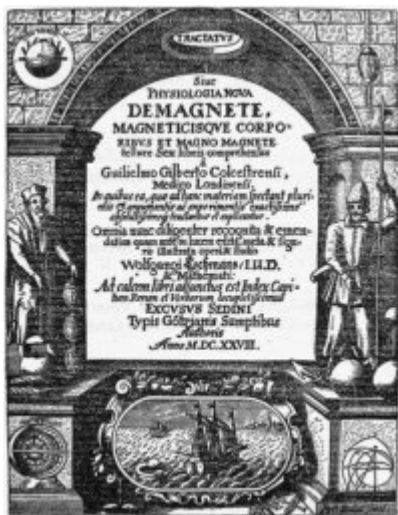
Title Page of De Magnete, by William Gilbert

Magnets, known as lodestones, and their properties of attraction, were well known to the Greeks and the Muslims, and sailors knew that a compass needle pointed towards the north. However, the exact reasons for this were unclear, with many scholars proposing that they were attracted to the North Star or to a group of magnetic mountains lying somewhere within the Arctic Circle. Gilbert was not happy with these explanations and set out to test the properties of magnets, seeking the advice of ship's masters and compass manufacturers. He discovered a number of properties of magnets, using a large, spherical lodestone and a freely moving compass needle.