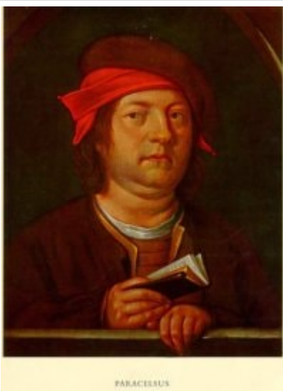
Portrait of Paracelcus

Paracelsus was one of the prime movers in the shift away from superstition and dogma in medicine, causing Renaissance physicians to rethink how they approached illness. Born in 1493, in Einsiedeln, Switzerland, he initially enrolled at the University of Basle at the age of 16, to study medicine. He soon became disillusioned with the established practices and travelled across Europe, studying and working, eventually becoming an army surgeon in Italy. Here, he gained a reputation as a doctor possessing 'miracle cures' and soon returned to Basle, in 1527. Back in the city, he cured a patient of a leg infection, without amputation, the most common practice, and this further enhanced his reputation.