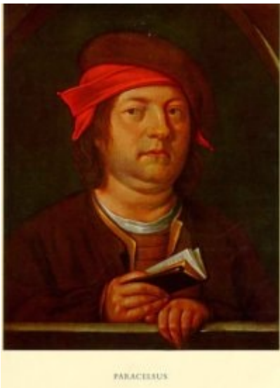
Portrait of Paracelsus (Public Domain)