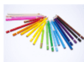
Quiz: Psychology 101 Part 2