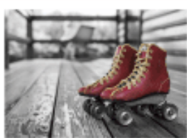
Quiz: Psychology 101 Part 2