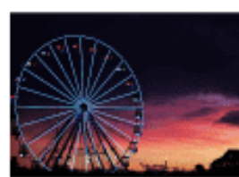
Quiz: Flags in Europe