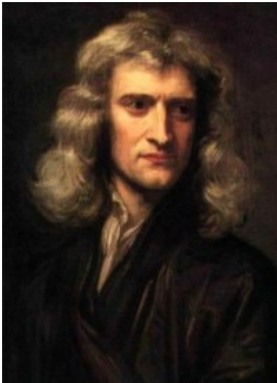
Isaac Newton, painted by Godfrey Kneller 1689 (Public Domain)

Newton's work on the movement of bodies and gravitation would not become influential until halfway through the next decade when, in 1684, Edmund Halley, later to become the Astronomer Royal, asked for Newton's input in a particular area of planetary motion. For a while, mathematicians and physicists had proposed the influence of gravity upon planetary motion, and suspected that a force emanating from the sun influenced the movement of the planets. This unseen force tied the planets into orbits and followed the inverse square law, where the force acting upon the planets was inversely proportional to the square of the intervening distance. However, they had no way of proving it, despite the attentions of some of the greatest minds of the age. Upon asking Newton for his insights, Halley found that the scholar had already proved this, so Newton set about writing the proofs, giving a series of lectures and expanding them into his notable Mathematical Principles of Natural Philosophy . This book, also called the Philosophiæ naturalis principia mathematica , or the Principia , regarded as a landmark text that stands alongside Euclid's Geometry as a book that changed the scientific world.