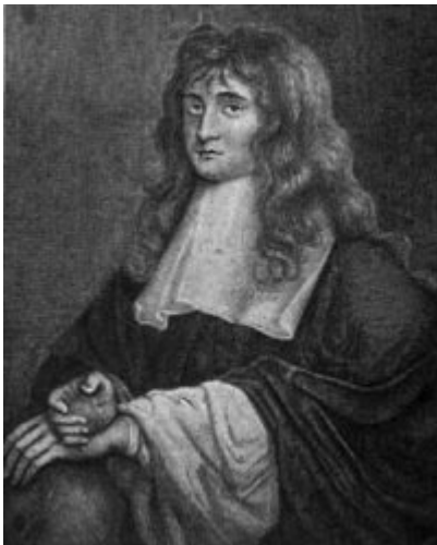
Newton as a young

When talking of Renaissance history and the Enlightenment, Isaac Newton (1643-1727) stands as the scholar who oversaw the transformation from Renaissance thought, still largely built around a religious framework, to a quest for knowledge without the need for God.