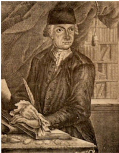
Portrait of Johan Gottlob Lehmann

Away from the theoretical aspects, empirical geology was progressing as scholars studied rock formations in mines and canal embankments. In France, Jean Ettienn-Guettard (1715-1786) and Niclas Desmarest (1725-1815) completed a geological survey of the country, producing a detailed geological map of rock formations in 1780. In Germany, where great