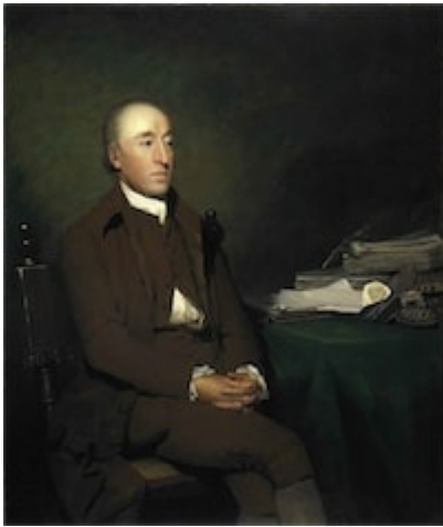
Portrait of James Hutton, the founder of modern geology

Charles Lyell and James Hutton (1726-1797) further contributed, with Lyell producing a textbook, 'Principles of Geology' , laying out the basic theories and principles governing the science. The Scotsman, Hutton, was notable in that he opposed the ideas of Werner. He studied rock formations in Scotland and the North of England, proposing that igneous rocks were younger and developed from molten extrusions from the center of the Earth.