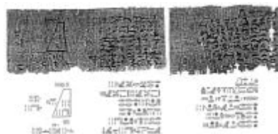
Moskow papyrus

The Rhind papyrus discovered by Henry Rhind, in the 19th century, dates from 1650 BCE and is filled with problems and solutions, also including a section on fractions. The Egyptians preferred to reduce all fractions to unit fractions, such as 1/4 , 1/2 and 1/8 , rather than 2/5 or 7/16 . All of these complex fractions were described as sums of unit fractions so, for example, 3/4 was written as 1/2 + 1/4 , and 4/5 as 1/2 + 1/4 + 1/20 . This seems a little unwieldy but is actually straightforward to use once you are used to it.