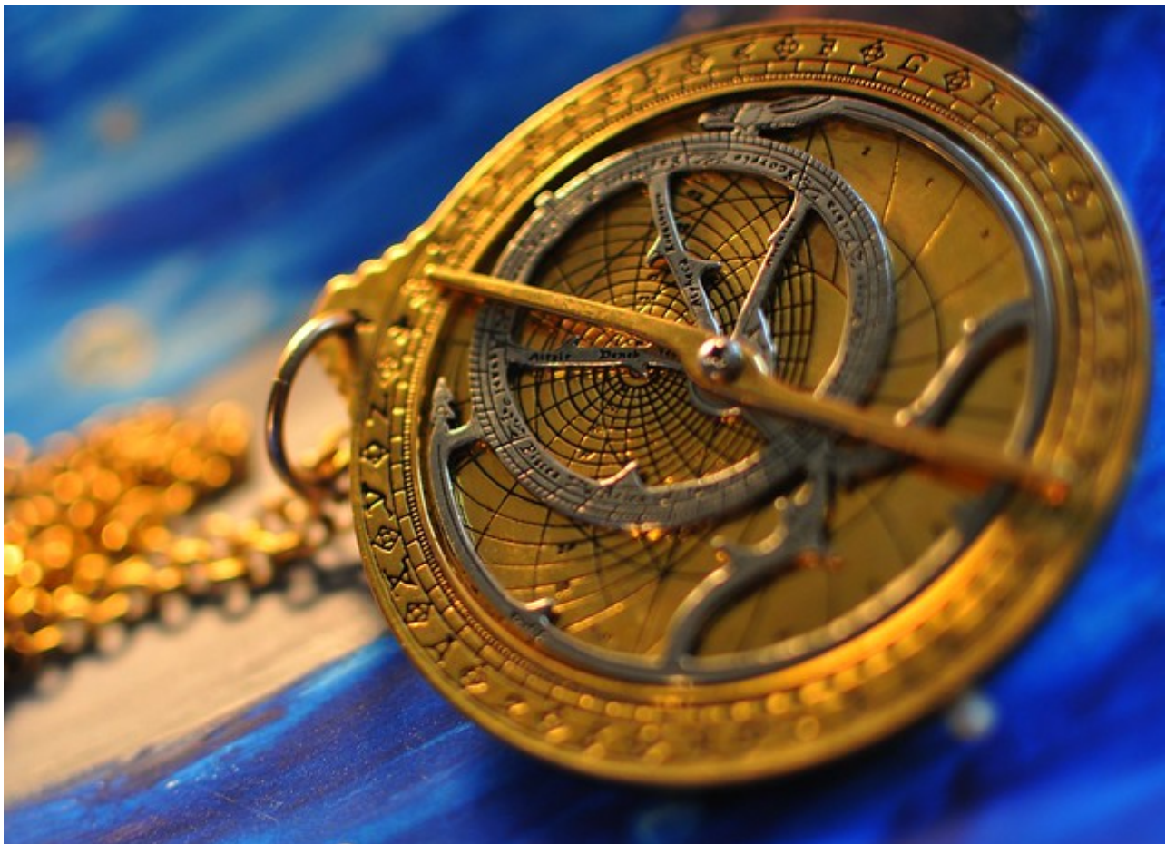
Chaucer's Astrolabe, Viewminder

The astrolabe is an ancient device, long used to measure latitude and act as an aid to navigation. Historians believe that the first astrolabes were devised by the Ancient Greeks, with astronomers such as Apollonius (c. 262 BCE – c. 190 BCE) and Hipparchus (190 BCE – c. 120 BCE) developing the theory behind the device.