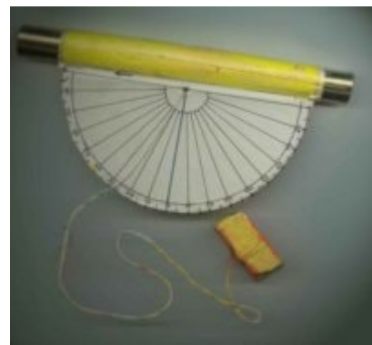
Simple Clinometer (Public Domain)